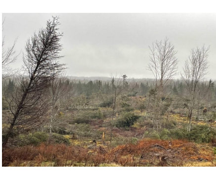
Impact of Fiona on variable retention harvests completed last year in District 2 West

Nova Scotia forests were heavily damaged leaving a mess of fallen trees regardless of any past management. On PHP's crown license area, the heaviest damage is in Guysborough, Antigonish and Pictou counties, as well as significant damage in eastern Cape Breton county. During the last several weeks, the NS Department of Natural Resources & Renewables completed aerial surveys to assess the level of damage to forests across Nova Scotia. For PHP's Crown license area, Woodlands district staff went along to see how the forest management area was affected and the need for salvage operations, particularly for treatments recently completed where varying levels of retention were left on site. The Department of Natural Resources & Renewables has developed a salvage plan to try and harvest as much high-quality fibre while still leaving wildlife clumps, permanent reserve trees, treetops, and other areas of retention for nutrient and biodiversity needs. Areas for salvage are currently being submitted to the Department for approval so operations can hopefully begin early in 2023. For PHP, getting as much fresh fibre to the mill safely, efficiently, and economically feasible is critical for the next 10 months since anything beyond that can start to affect the quality of the wood that is needed for the mill.