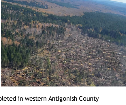
Impact of Fiona on a recent variable retention harvest completed in western Antigonish County