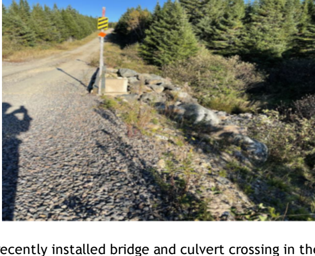
On-site audit visit to a recently installed bridge and culvert crossing in the Cape Breton Highlands.